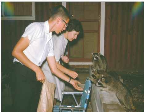
My Mom and I feeding the raccoons at the resort in 1965.

My parents and I vacationed in the North Woods for a week or two almost every year. They picked a different resort on a different lake every time. In August of 1965, they picked the Pride of the North on Little St. Germain Lake.