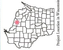
Project Location in Wisconsin

Sources: Roads and Hydro: WDNR Aquatic Plants: Onterra, 2012 Map Date: October 9, 2012 File Name: LSG_2012_EWM_Survey_2012.mxd